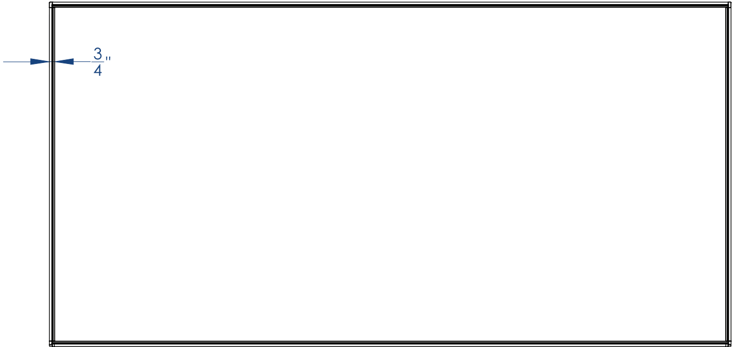
Line Drawing Front View